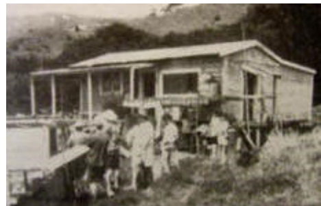
Photo: The Bach at Sugar Loaf